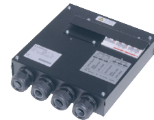
External (optional) Maintenance Bypass Switch